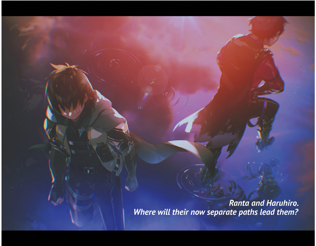
Ranta and Haruhiro. Where will their now separate paths lead them?